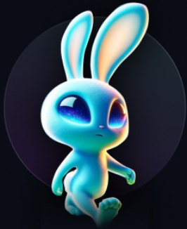
The Alien Bunny